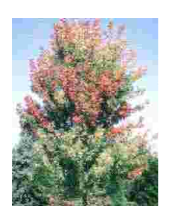
Autumn Blaze Maple

Fast growing, brilliant red fall color. Develops a dense oval shape with strong branching. 40-60 ft. tall with 40-60 ft. spread.